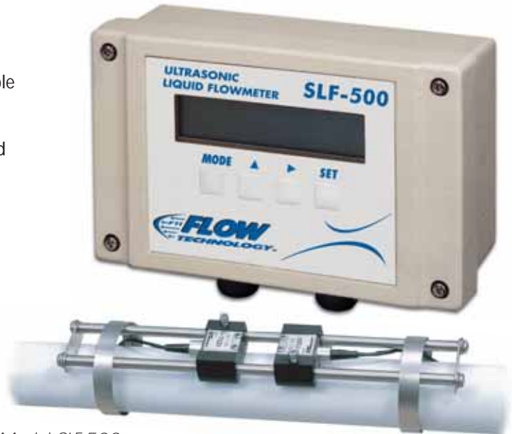
Model SLF-500 Ultrasonic Liquid Flow Meter